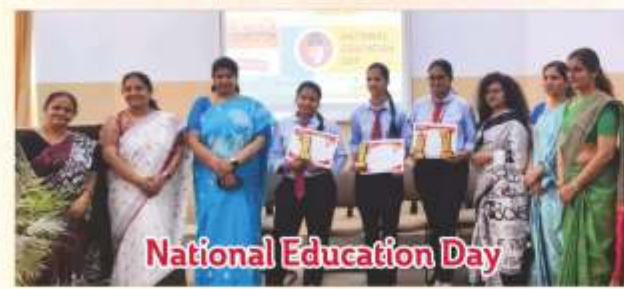
National Education Day