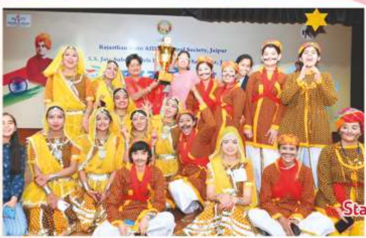
State-level Folk Dance Competition (Youth Fest)