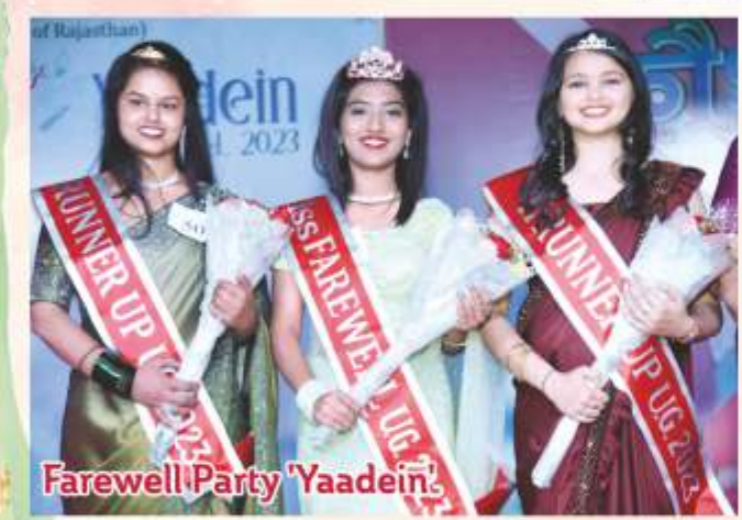
Farewell Party 'Yaadein'