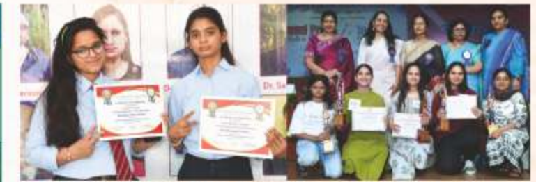
Career Counselling & Placement Cell