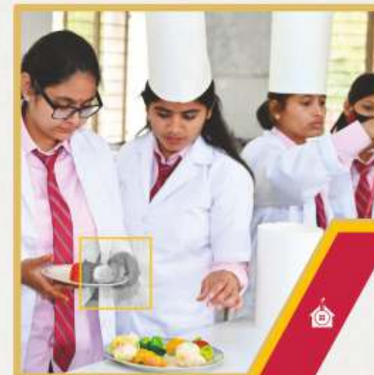
HOME SCIENCE LAB